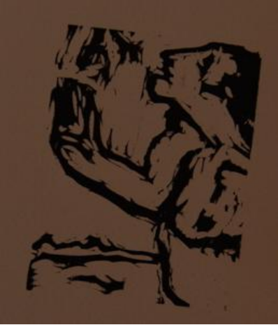
page from Zonta: Images of Women