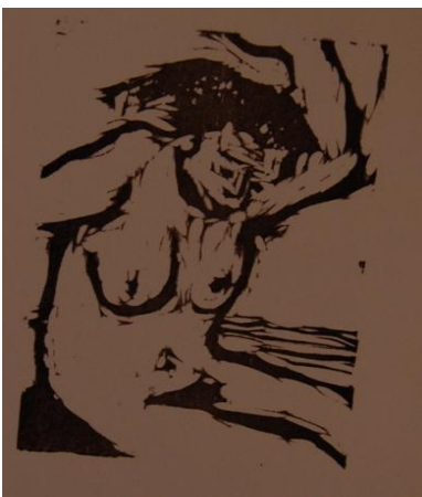
page from Zonta: Images of Women