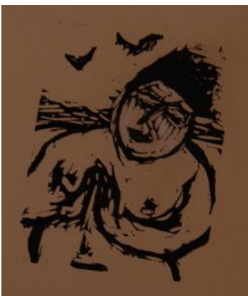
page from Zonta: Images of Women