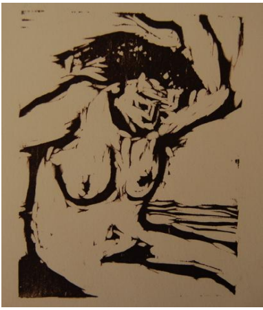
untitled small female nude