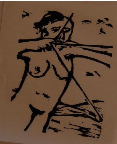
page from Zonta: Images of Women