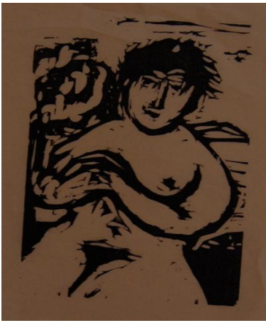
page from Zonta: Images of Women