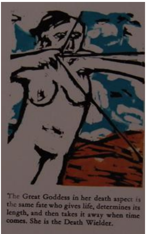
Death and Regeneration Mysteries