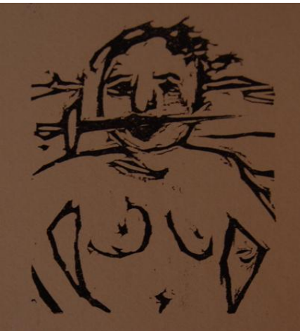
page from Zonta: Images of Women

signed lower centre "Gillian Mann" dated lower right "1990"