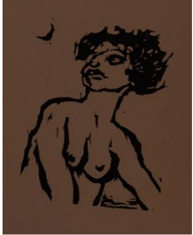
Death and Regeneration Mysteries