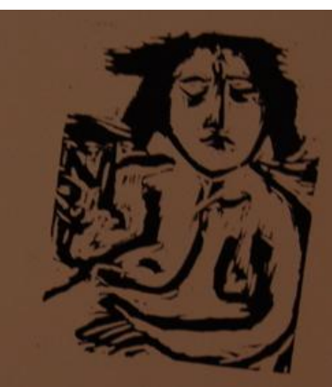
page from Zonta: Images of Women